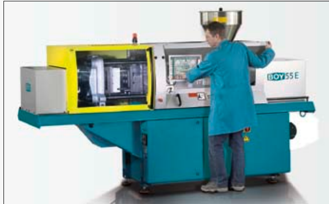
The E-Series from BOY: MORE ECONOMICAL. QUIETER. FASTER. MORE PRECISE.

Energy efficiency matches the value of electro-mechanical machines but without the inherent disadvantages such as wear, high investment, spare parts costs, and the high connected load. Compared to machines with electronically controlled variable displacement pumps, the energy consumption of the drive is reduced by half and even lower than that of