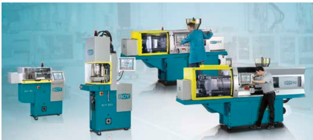
BOY XS / XS V and the E-Series machines debuted in the U.S.A. at NPE 2009 in Chicago

During NPE 2009, our new machine models and technologies were keenly embraced by the large number of visitors to our booth. Based upon our meetings and subsequent activities, we are experiencing very favorable results. Thank you all very much for visiting with us during NPE 2009 and for your continued interest in BOY.